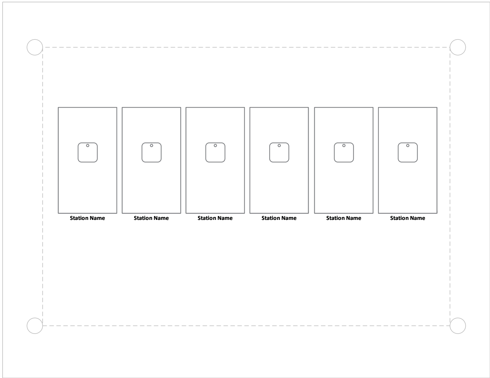
5" x 7" Plaque Manufacturer (Deflect-o) Part #: 691190 Demco Part #: 12149110