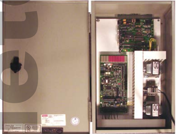
LTOM with cover in open position

The unit is designed to be used with a building automation system so incoming calls can be processed by the BAS for execution. Execution speed will vary with your building automation system application. The digital human voice may be customized to allow for site specific messages and uses no moving parts.